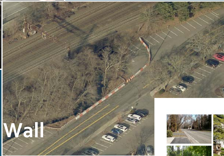
Theodore Fremd Wall $2.0M (City Share: $1.5M)