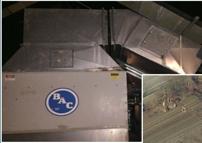
City Hall HVAC Replacement $2.4M